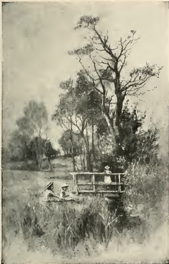
Near his fav'rite tree